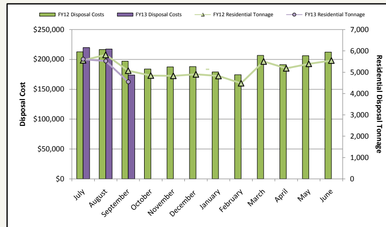
Solid Waste Disposal Cost