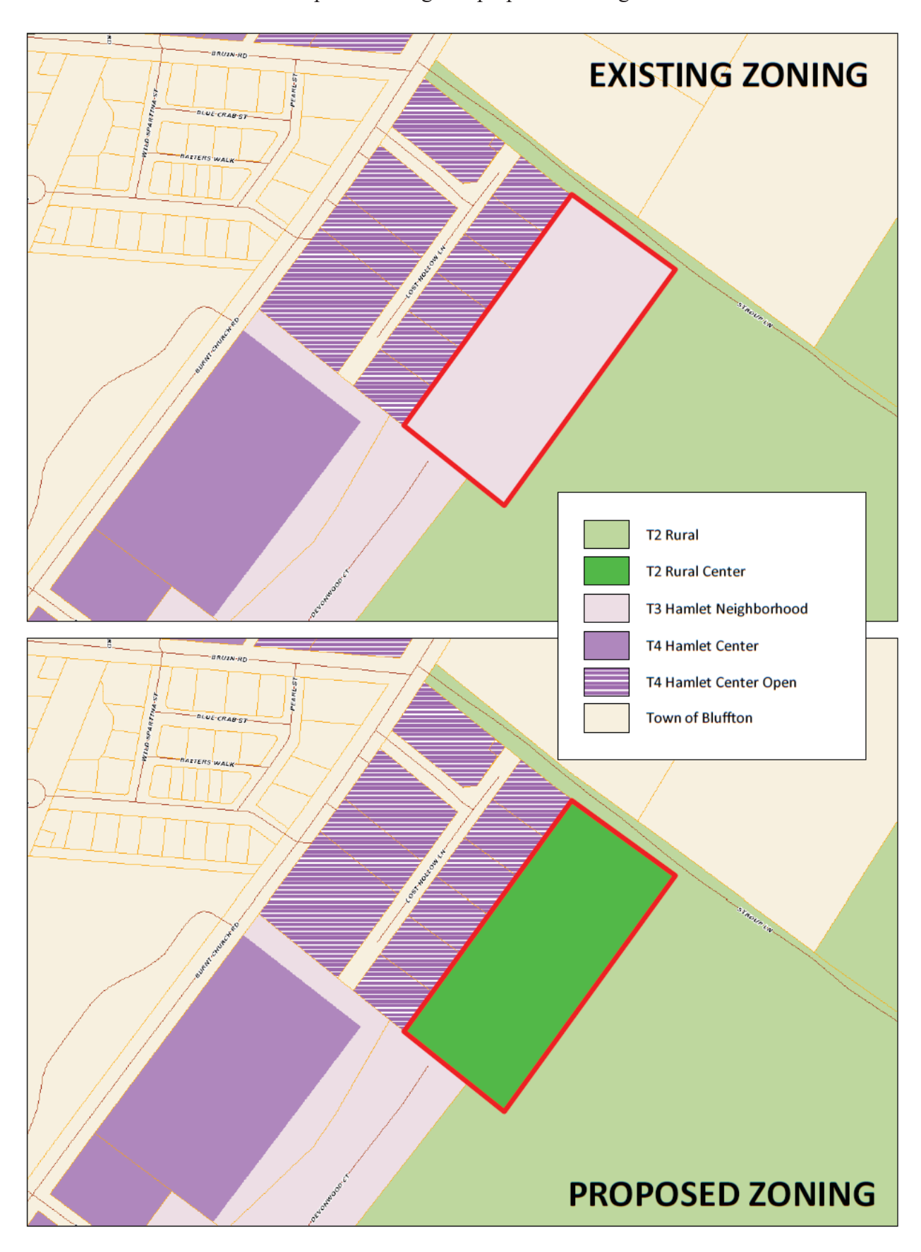
Map 1: Existing and proposed Zoning