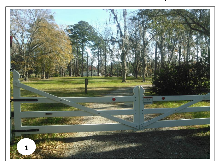
PHOTO SUMMARY OF STREET RENAMING OF A PORTION OF CRYSTAL STREET WITHIN RIVER WATCH POINT SUBDIVISION TO WATCH POINT, STUART POINT-SEABROOK AREA, PORT ROYAL ISLAND