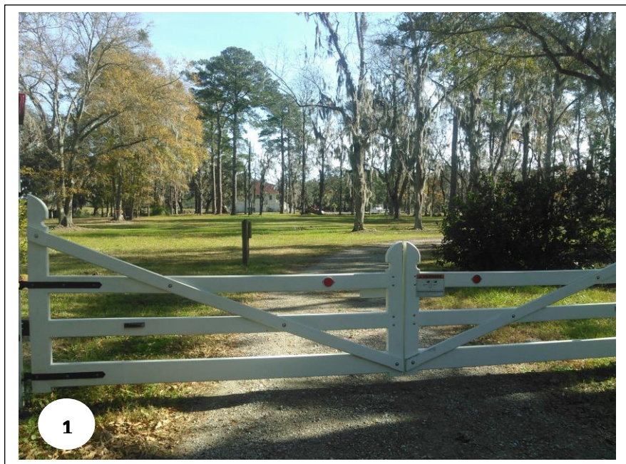
PHOTO SUMMARY OF STREET RENAMING OF A PORTION OF CRYSTAL STREET WITHIN RIVER WATCH POINT SUBDIVISION TO WATCH POINT, STUART POINT-SEABROOK AREA, PORT ROYAL ISLAND