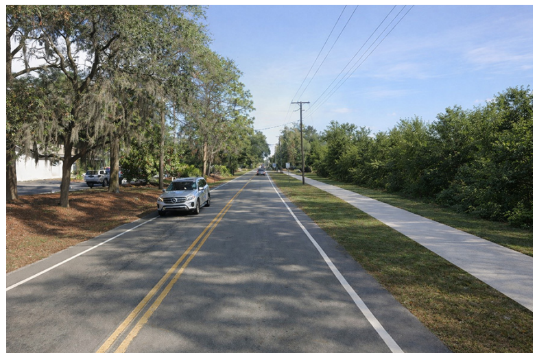
Sidewalk from Bruin Road north to Bluffton Parkway