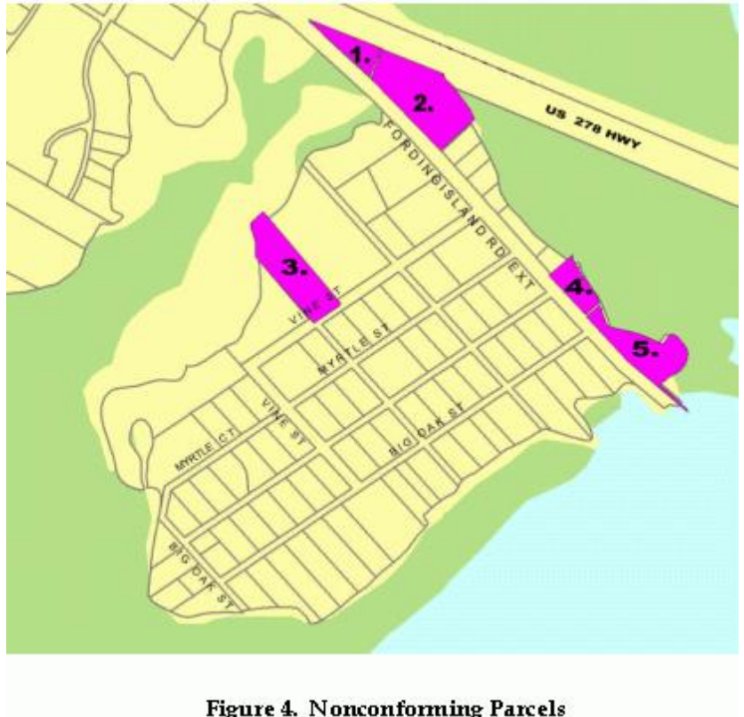
Figure 4. Nonconforming Parcels