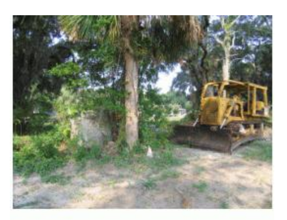
Figure 6. The Future We're Trying to Avoid

Plan implementation: The Community Preservation Committee has identified the above goals and objectives as fundamentally important for maintaining and improving the Buckingham Landing community's character and the health and safety of its residents. Many of the above objectives were completed during the preparation of the Plan and ordinance. To ensure that existing momentum is not lost for achieving the community's goals, the CP Committee has agreed to continue meeting on a quarterly basis at a minimum. Committee members can also call meeting to address immediate concerns.