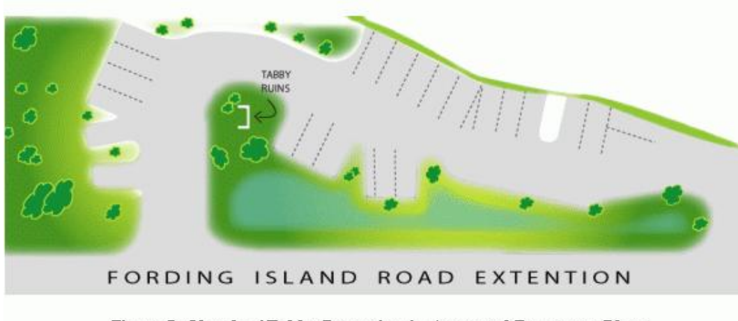
Figure 5. Sketch of Tabby Protection in Approved Restaurant Plans

The person in charge of these as the top tabby determinations, regarded expert in South Carolina at the time indicated that the tabby group did not quality as a significant historic structure. However, they do represent the last remaining evidence of historical properties in Buckingham Landing, so they have community historical significance. The approved plan for restaurant construction shows that the tabby ruins are to remain standing within the restaurant parking lot. Building Codes personnel have been making frequent checks for construction compliance and should include the status of the tabby as part of their observations.