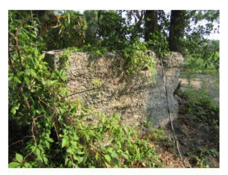
Photo 2. One of the Remaining Pieces of Tabby on Buckingham Landing

The person in charge of these as the top tabby determinations, regarded expert in South Carolina at the time indicated that the tabby group did not quality as a significant historic structure. However, they do represent the last remaining evidence of historical properties in Buckingham Landing, so they have community historical significance. The approved plan for restaurant construction shows that the tabby ruins are to remain standing within the restaurant parking lot. Building Codes personnel have been making frequent checks for construction compliance and should include the status of the tabby as part of their observations.