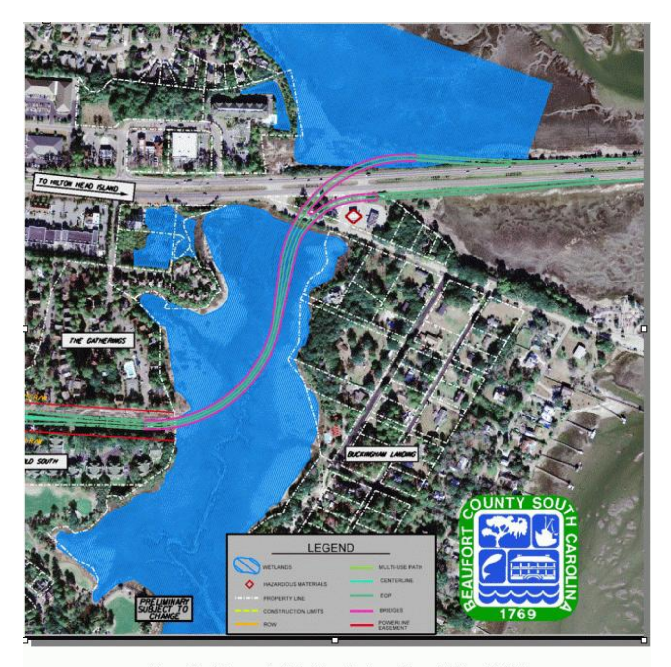
Figure 3. Alignment of Bluffton Parkway Phase 5, March 2007

GOAL: Improve external vehicular access to the community while maintaining the neighborhood's single-entrance character.