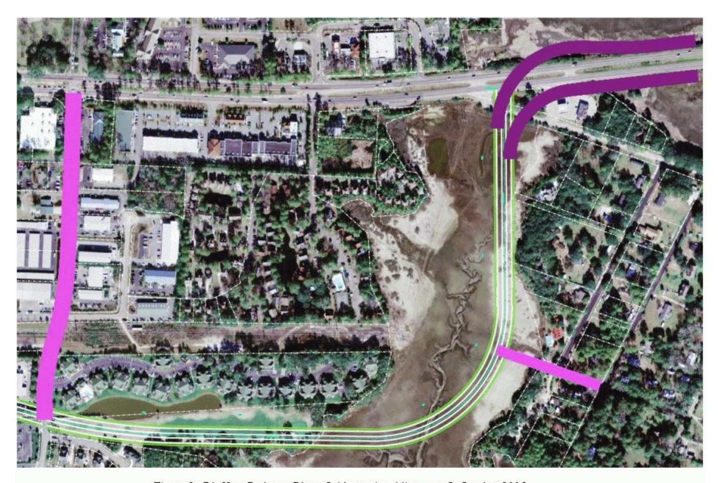
Figure 2. Bluffton Parkway Phase 5 Alternative Alignment 3, October 2006

Road Extension must be closed. If, not, the Landing will become a short cut resulting in heavy through-traffic and increased threats to public safety.