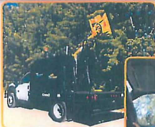
OPTIONAL OVERHEAD RIGHT SIDE VIEWING WINDOW

Then once you've finished the job you can drive the TruckKat on the highway at the same speed as the traffic flow - increasing safety, cutting down on drive time and improving overall productivity. Experience the power of the all-season Tiger TruckKat.