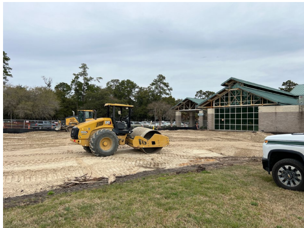
Mass Grading, Pad Prep