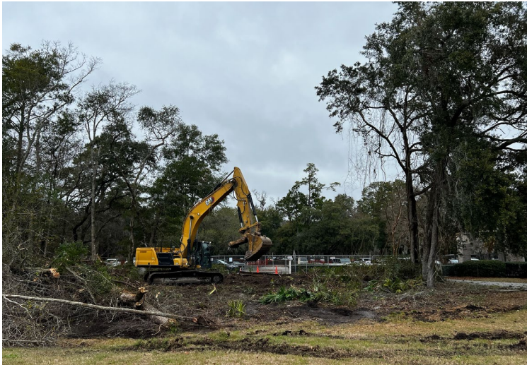
Tree Protection, Erosion Control, and Clearing