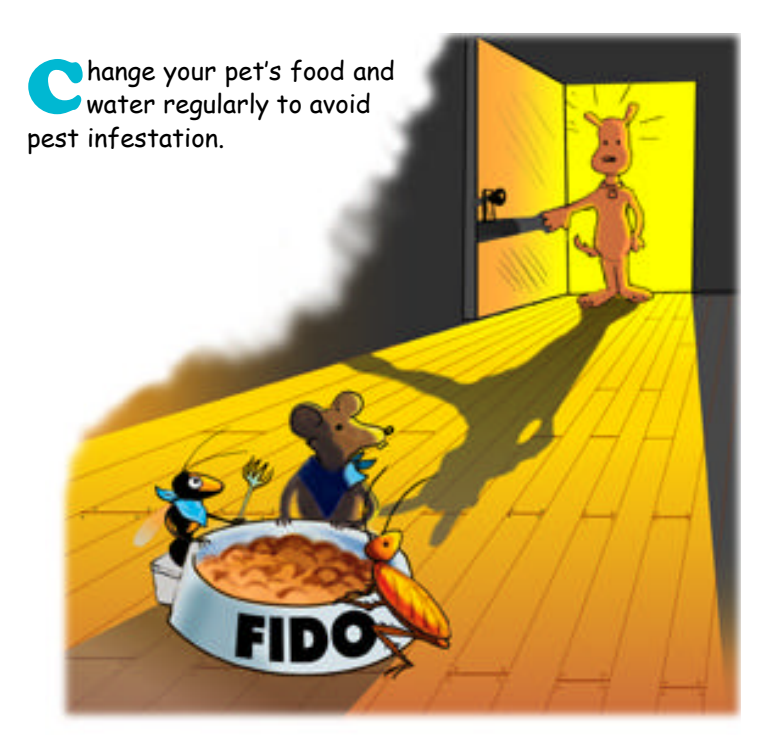
Leftover food in and around your home can attract unwanted pests, insects and disease.

accinate your pets to protect them from disease. Licens your pets to protect them from loss. Vaccination clinics and dog licenses are available through the City of Los Angeles Department of Animal Services.